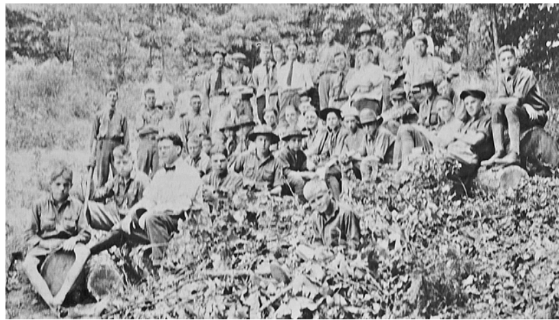
In 1920, Troop 1 (now Troop 21) took a trip to North Carolina for an unofficial BSA Jamboree. Dan Beard is the gentleman in the campaign hat on the back row.